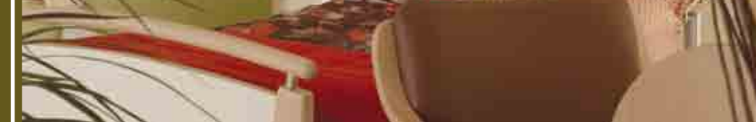
Toocana, gentle vitality...