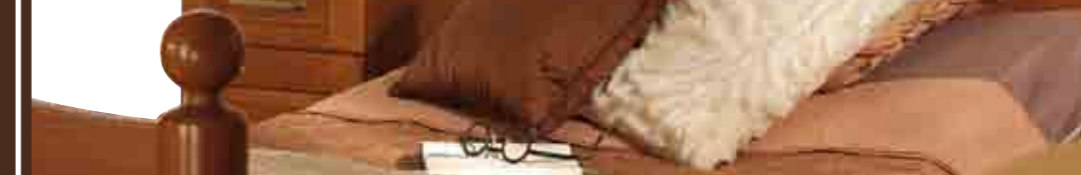
Gwanara, style and elegance...