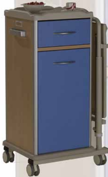
Meltis Cabinet BL261