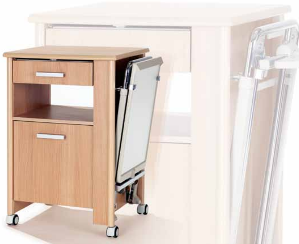
Meltis Cabinet CH284