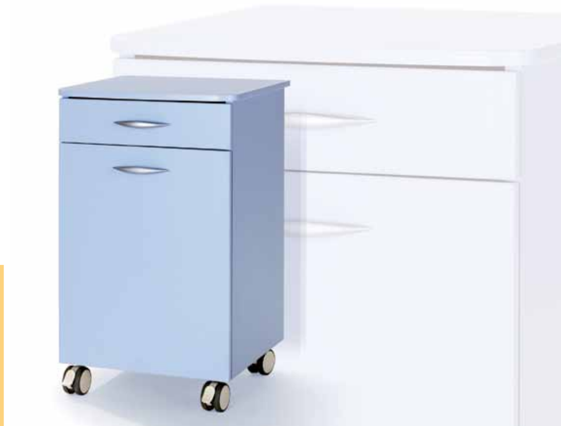
Meltis Cabinet CH242