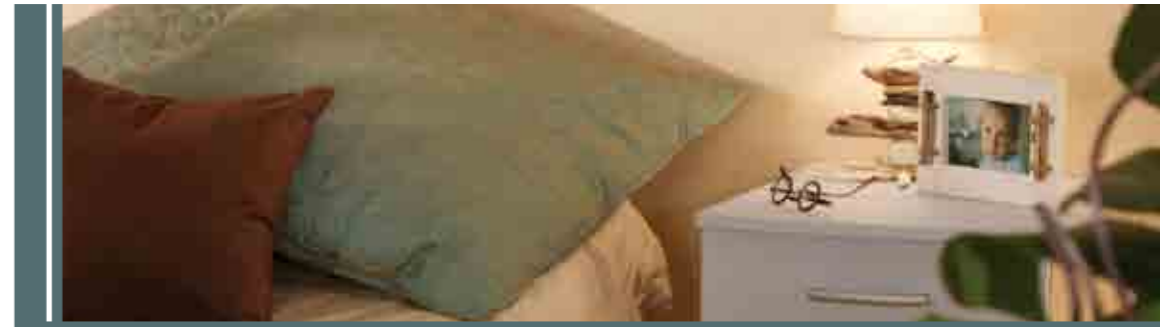
Koati, simplicity and performance...